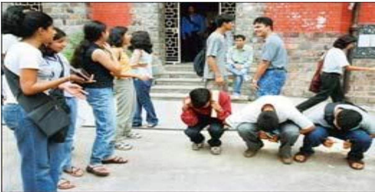
Photograph of Ragging: 4