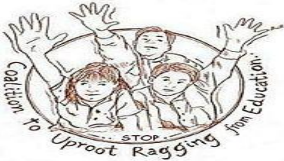
Photograph of Ragging: 3