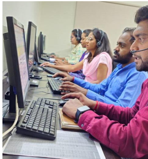
Dedicated Call Centre for Counselling