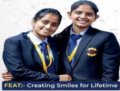
FEAT:- Creating Smiles for Lifetime