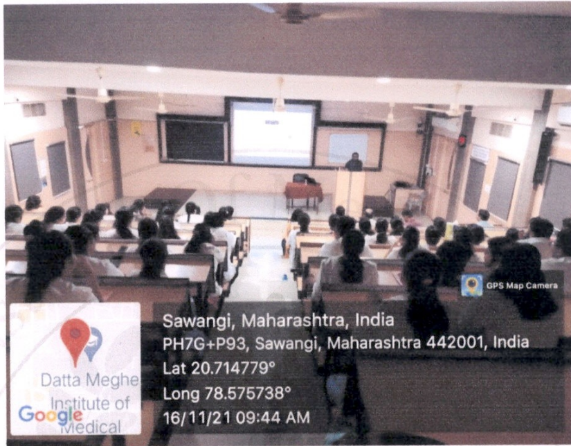
Snap shots of the Orientation Programme

Office : Atray Layout Pratap Nagar, NAGPUR - 440 022, Maharashtra (India) • Ph. +91-712-2229904 • Fax - 0712-2245318 • E-mail : info@dmimsu.com • Website - dmimsu.edu.in