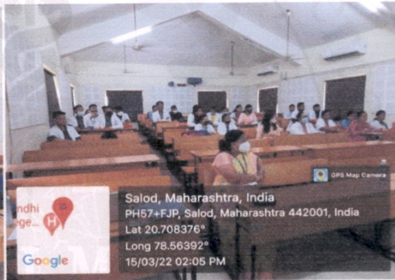
Snap shot of the attendance

Director S.H.P.E.R. DMIMS (DU) Sawangi (Meghe) Wardha