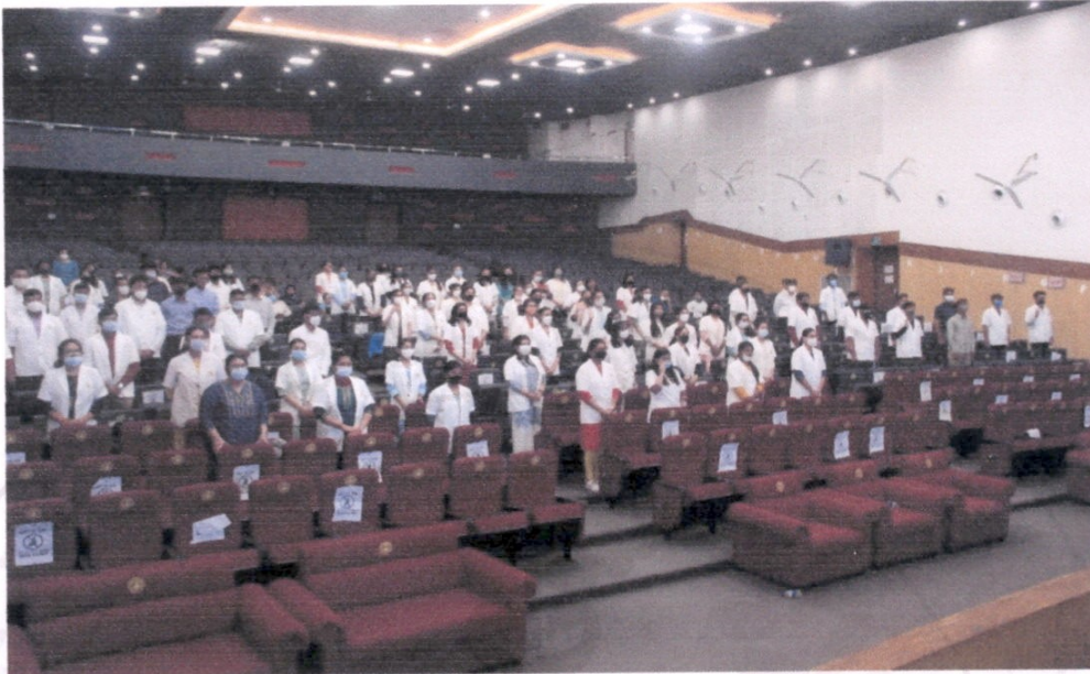
The foundation course attended students.

Office : Atrey Layout Pratap Nagar, NAGPUR - 440 022, Maharashtra (India) • Ph. +91-712-2229904 • Fax - 0712-2245318 • E-mail : info@dmimsu.com • Website - dmimsu.edu.in