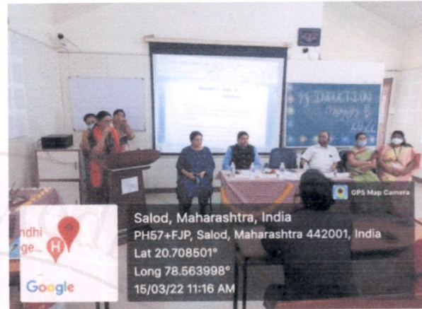
Snap shots of the PG Scholars batch 2021-22