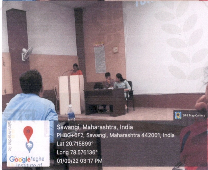
Glimpses of Oratory Championship Debate Club, JNMC