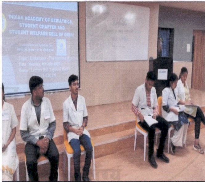
Glimpses of DEBATE COMPETITION in association with Indian Academy of Geriatrics, Student Chapter was conducted by The Debate Club, DMMS